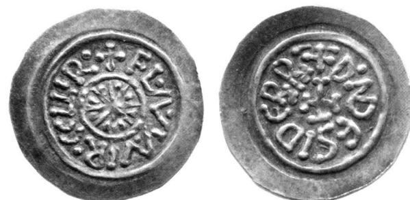
Fig. 3 (2:1).

Vercelli tremissis published in the auction catalogue, probably struck by Desiderius in 773–774