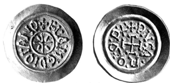
Fig. 6 (2:1).

Four-ray star tremissis of Charlemagne, struck in Milan, February 774–776/7 or 781.