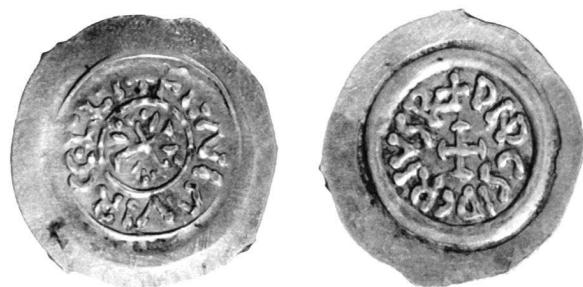
Fig. 2 (2:1).

Vercelli tremissis of the Ilanz cache probably struck by Desiderius in 773–774. Obv.: +FL•AVIAVIRCC•L•L•I, (AV ligatured), four-ray star with olives within sectors, four pellets between the main axis 12 of the coin and the olives. Rev.: +DNDCSIDCRIVS R x (ND and RX ligatured), a potent cross (with lunettes).